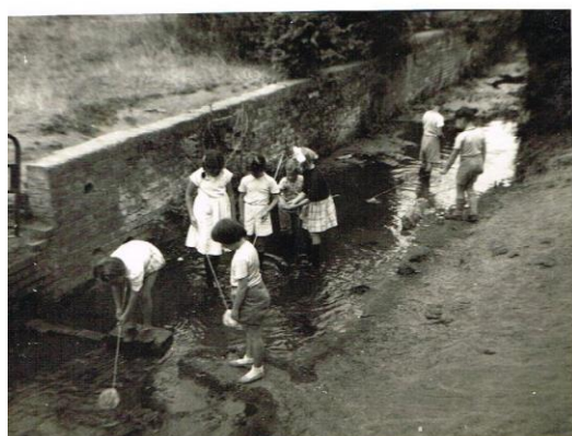
The Mill Brook c 1958 (Croft Villas Park)