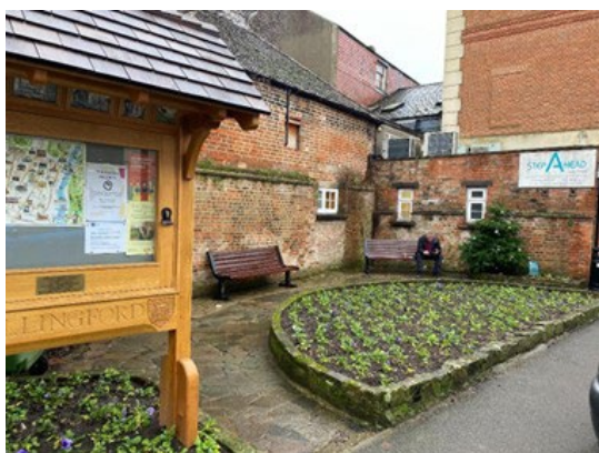
Figure 2. View from northern end

The garden measures approximately 15 x 5 metres and is adjacent to the town centre immediately accessible from and in full view of a busy road. The purpose of the garden is to provide residents and visitors with place to pause and rest or chat to friends. At ground level the garden is currently dominated by a raised flower bed. The tree on the left and shrub on the right, two benches, black cylindrical waste bin and the Town Council information board will be retained. The garden will also feature sustainable planting. The wheelie bin belongs to the coffee shop behind and will be hidden behind slatted fencing. The door provides access to the rear of the coffee shop. The selected artist is welcome to consider and make recommendations on the wider re-design of the garden, which could include alteration of the raised bed, to enhance synergy with the art installation.