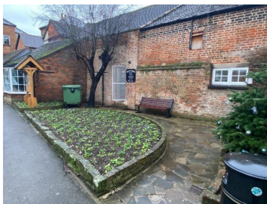
Figure 3. View from southern end