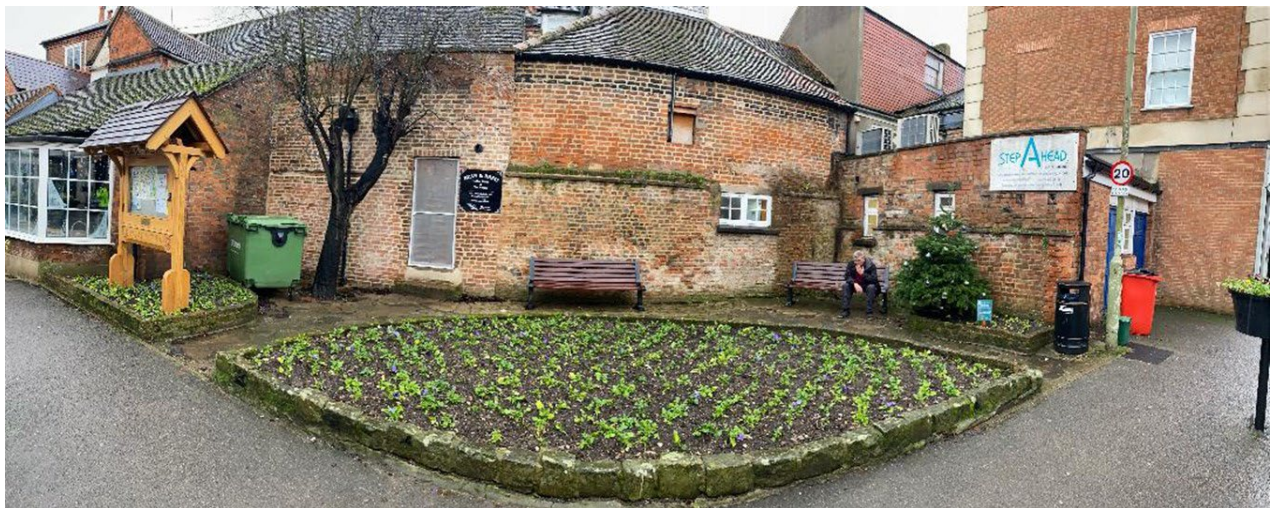
Figure 1. Current rest garden (image slightly distorted by use of the camera's panoramic function)

Near to the town centre market place is a small rest garden. Wallingford Town Council wishes to enhance the garden with a 3-dimensional art installation to commemorate the coronation of King Charles III and his love of the environment, particularly trees. The work will need to demonstrate contemporary artist flare but should also reflect the historic environment of the town and. An installation with the ability to support other features, such as hanging baskets, would be welcome.